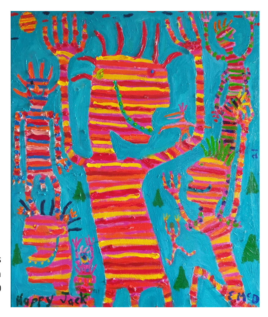
Happy Jack 2021 Oil on Canvas 60 x 50cm $8000