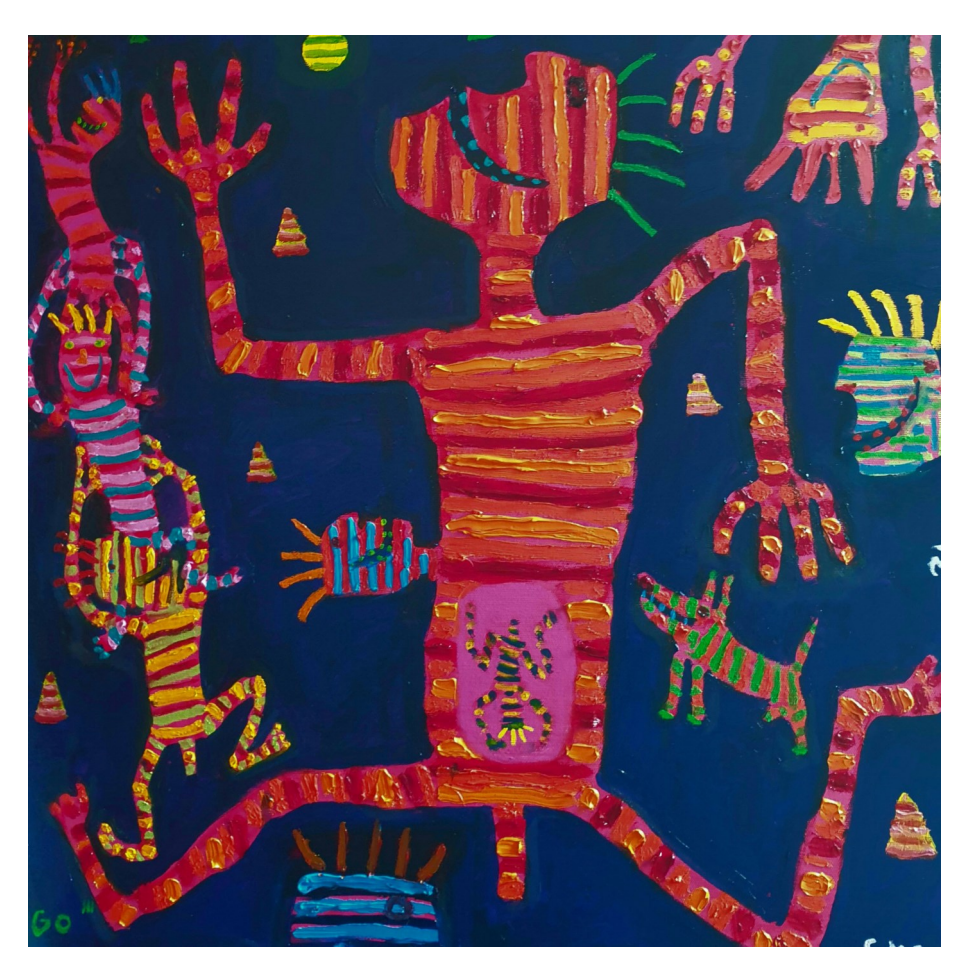
Go! III 2021 Oil on Canvas 76 x 76cm $10,000