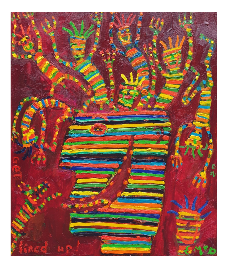
Get Lined Up 2020 Oil On Canvas 61 x 51cm $5000