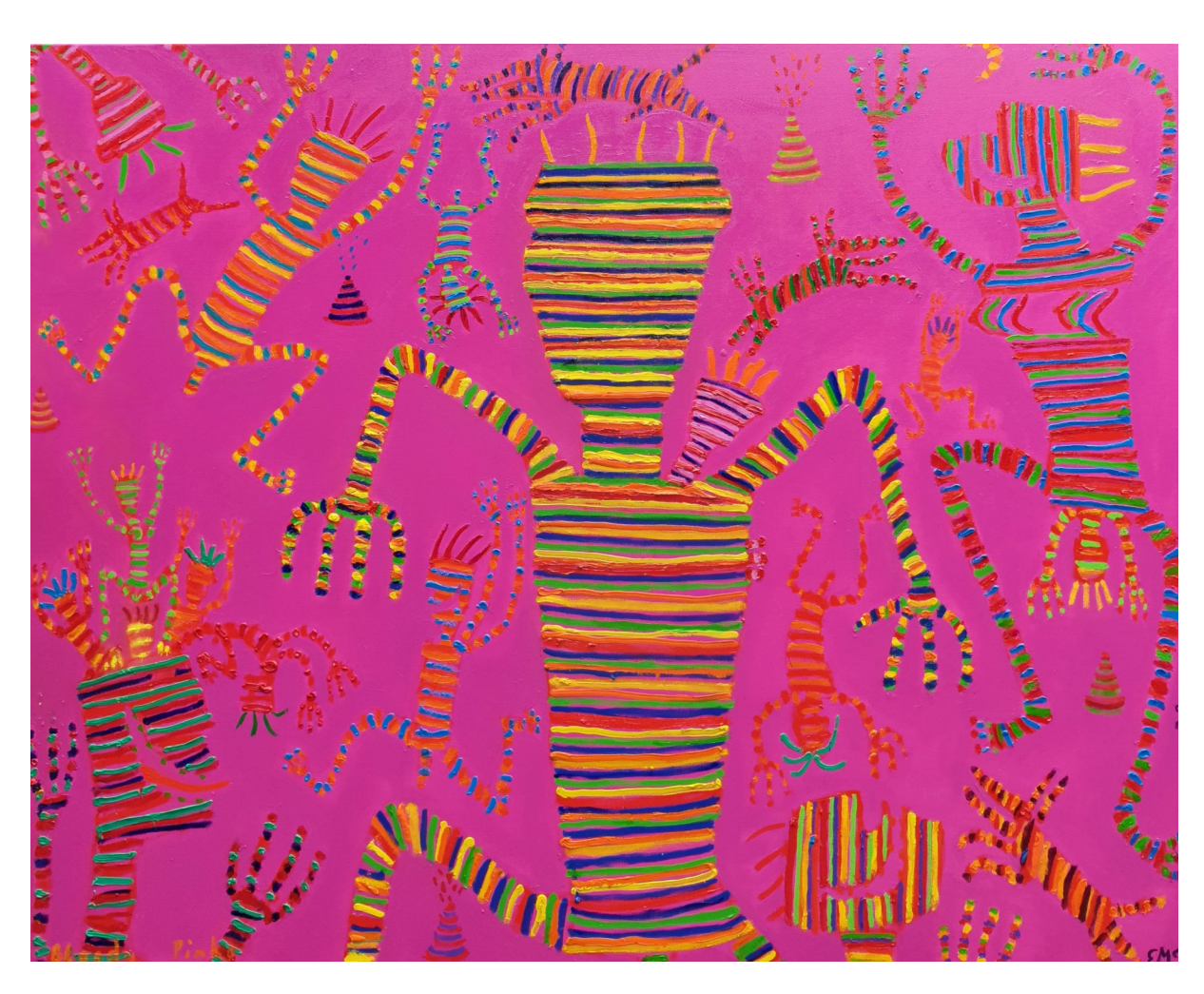
Bloody Pinko 2022 Oil on Canvas 120 x 150cm $20,000