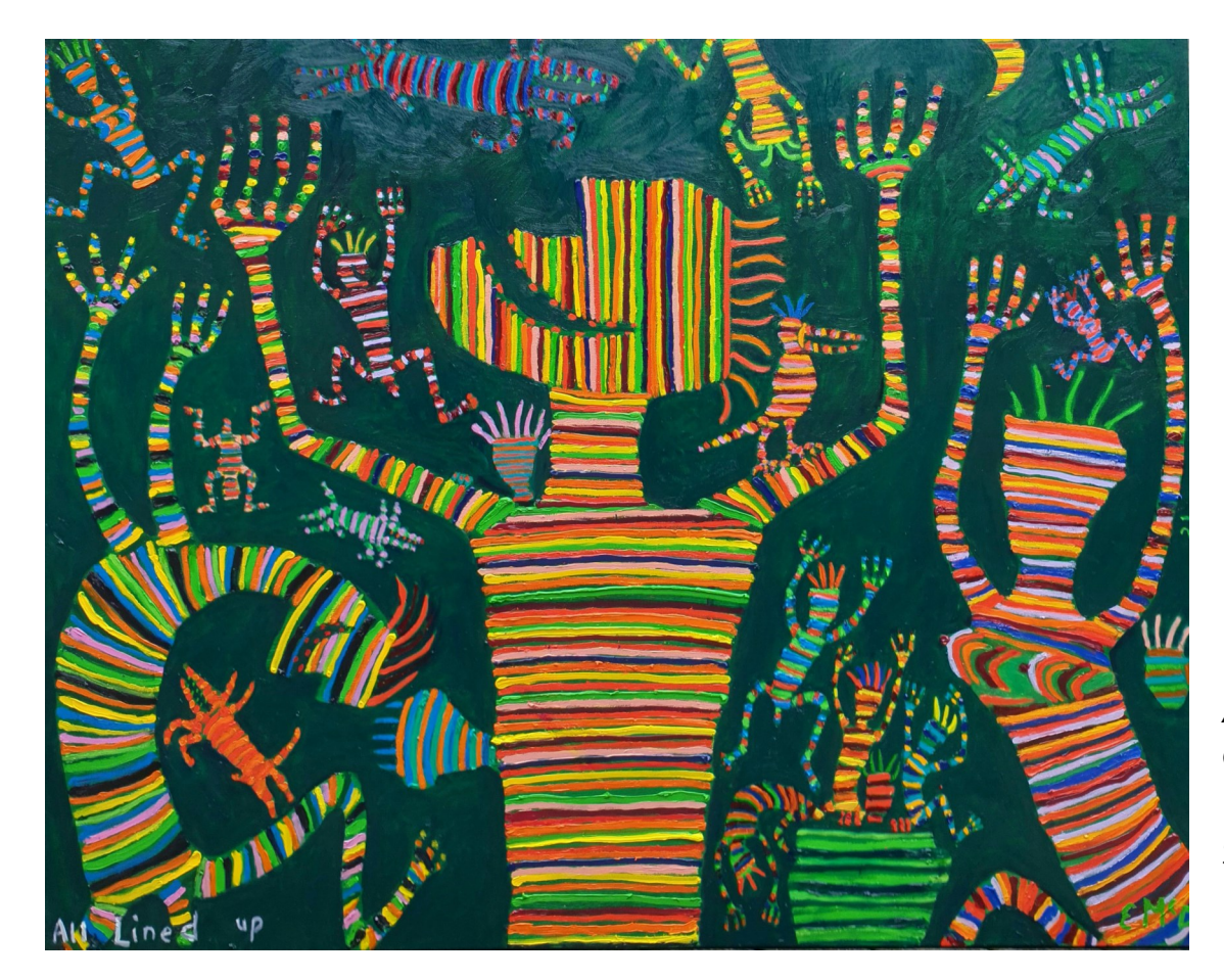
All Lined Up 2021 Oil on Canvas 120 x 150cm $25,000