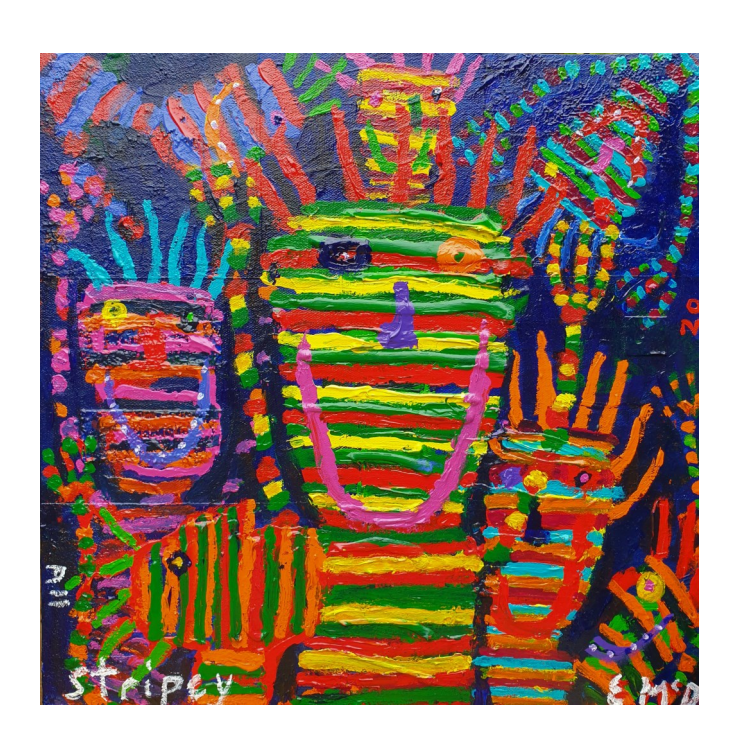
All Stripey 2020 Oil On Canvas 41 x 41cm $3500