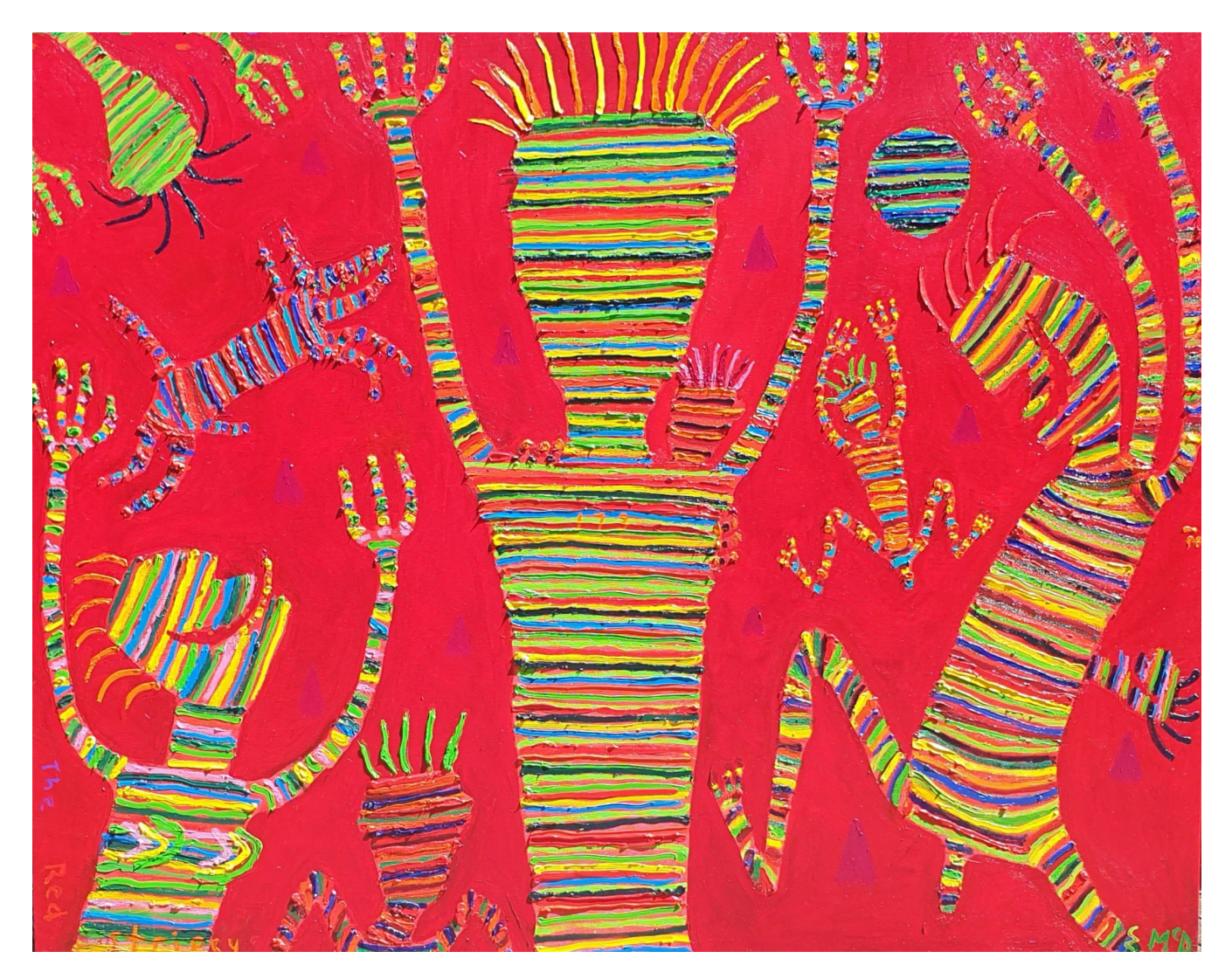
The Red Stripey 2021 Oil on Canvas 120 x 150cm $25,000

Further high quality photos, including detailed images are available - please just email for a selection