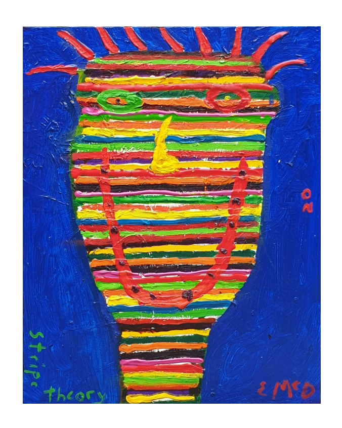
Stripe Theory 2021 Oil On Canvas 50 x 40cm $4000