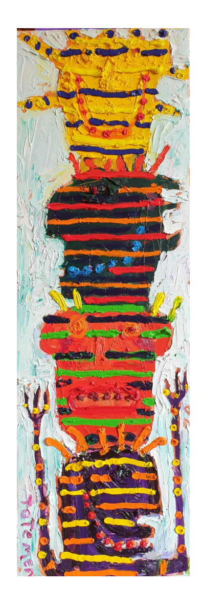
Totemen 2020 Oil On Canvas 76 x 25cm $7000