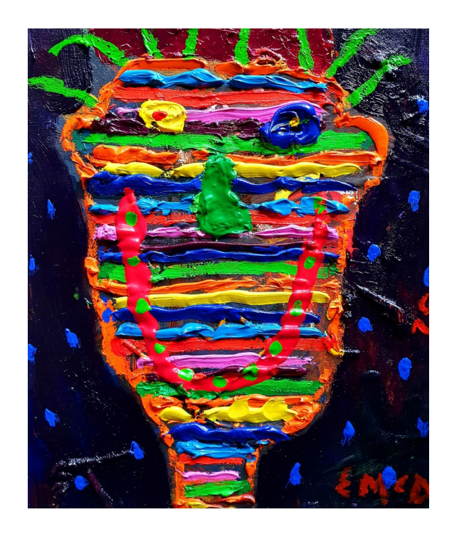
Stripeydelic 2020 Oil on board (framed) 28 x 24cm $6000