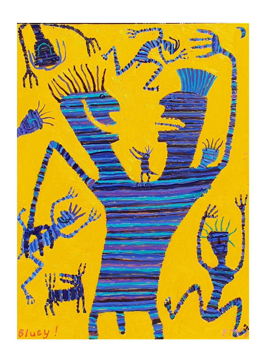
Bluey III 2021 Oil on Canvas 122 x 91cm $12,000