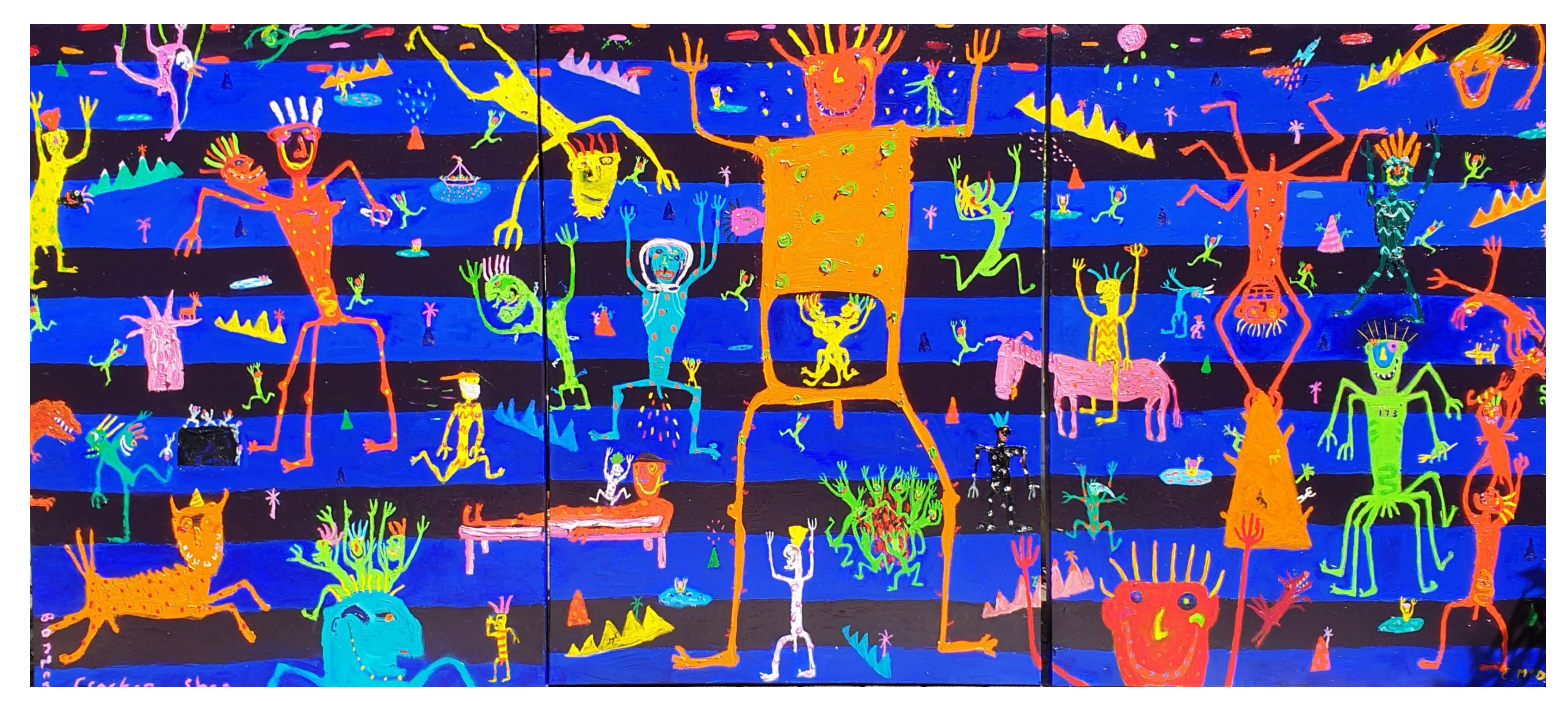
Bonzer Cracker Shag! 2022 Oil on Canvas (triptych) 122 x 273cm $40,000