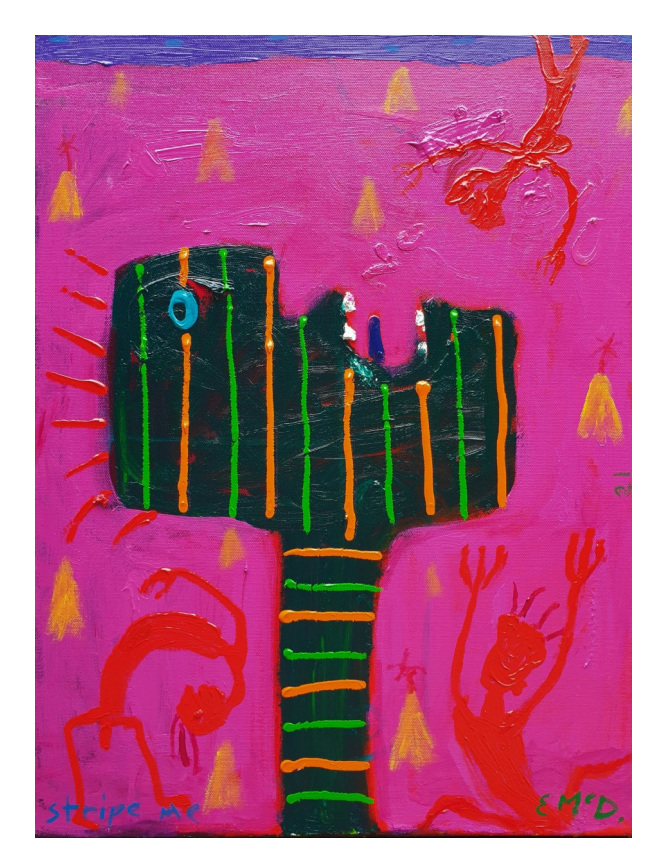
Stripe Me (Bloody Pink) 2021 Oil On Canvas 51 x 41cm $7000