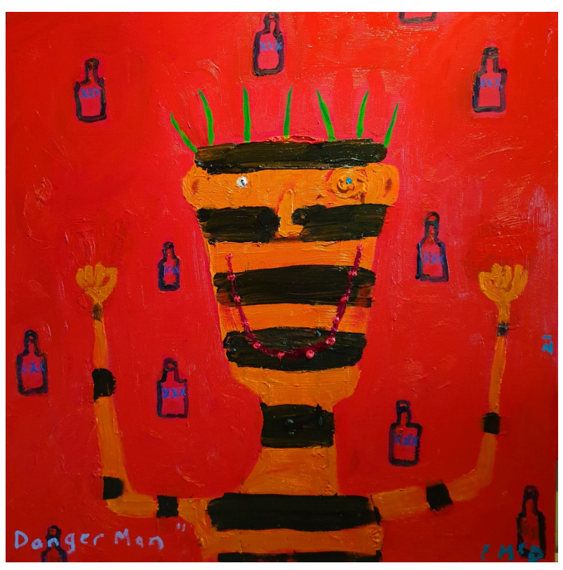
Danger Man II 2021 Oil on Canvas 76 x 76cm $9000