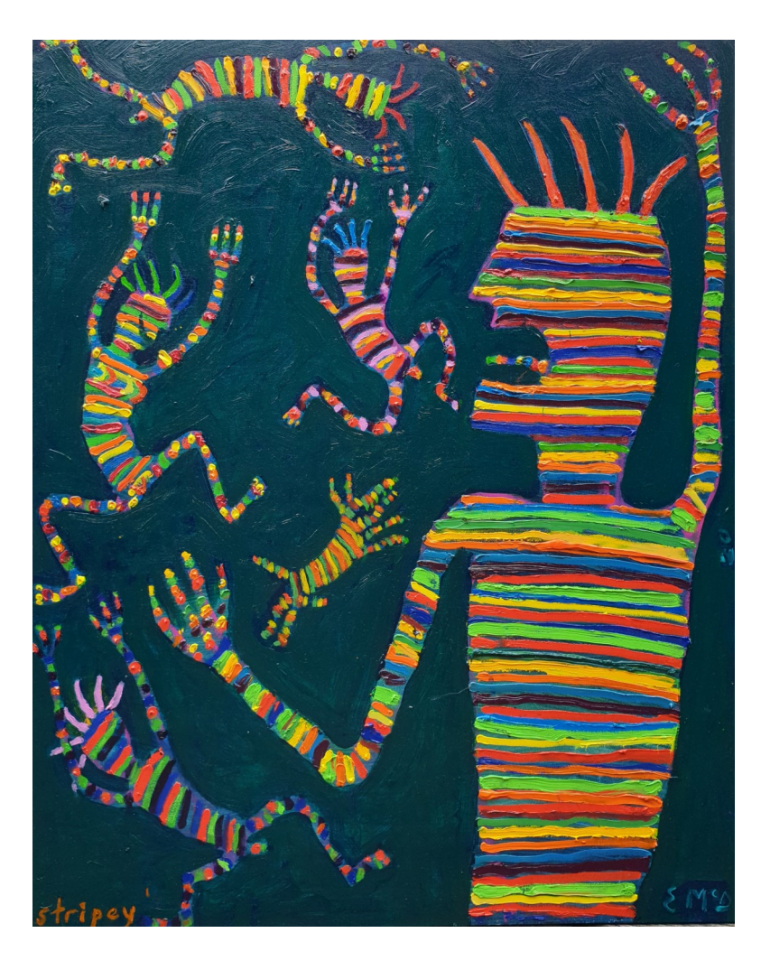
Stripey I 2020 Oil on Canvas 100 x 80cm $12,000