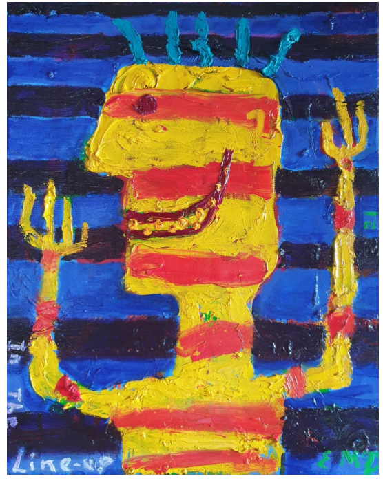
In the Line Up 2022 Oil On Canvas 50 x 40cm $4500